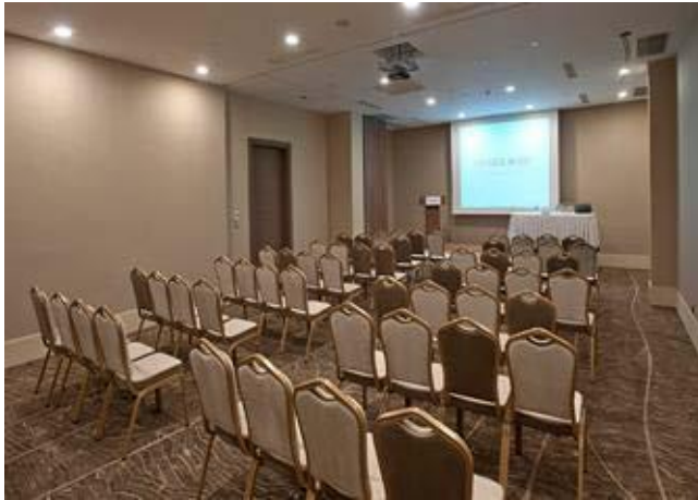
Heybeliada Hall- Büyükada Hall- Burgaz Adası Hall