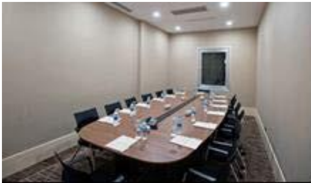
Sivriada Hall- Tavşan Adası Hall- Sedef Adası Hall- Yassı Ada Hall- Kınalı Ada Hall